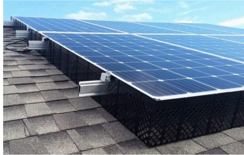
The SolaTrim Solar System Protection System

Best of all, says Veitch, is the ease of use: "It's well made and very simple to install. We live in Phoenix and it gets hot on these roofs in the summer. Installers don't want to spend any more time up there than they have to. SolaTrim makes it possible for them to install a solid, long term protection solution quickly and easily."