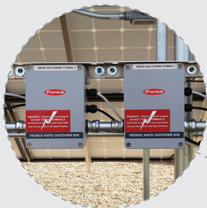
RAPID SHUTDOWN PROTECTION