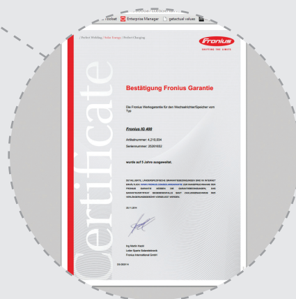
COMPREHENSIVE EXTENDED WARRANTY