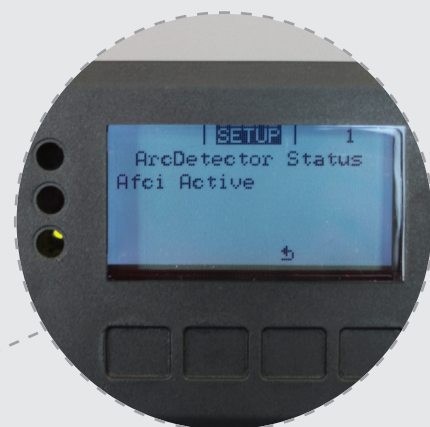
ARC FAULT PROTECTION