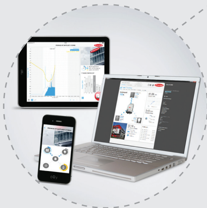
MONITORING AND PUSH ALERTS